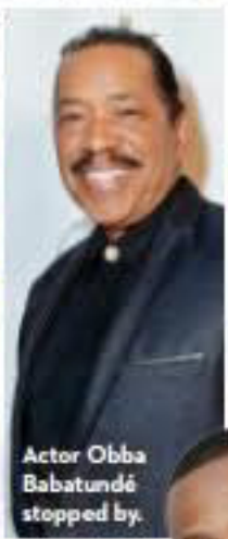
Actor Obba Babatundé stopped by.