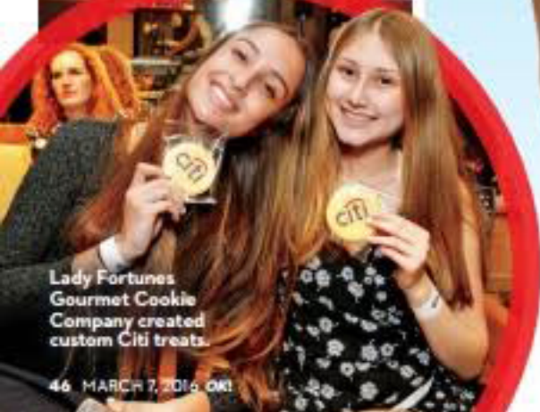
Lady Fortunes Gourmet Cookie Company created custom Citi treats.