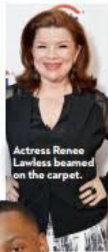
Actress Renee Lawless beamed on the carpet.