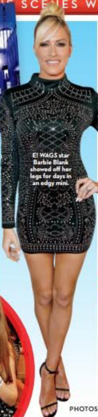
E! WAGS star Barbie Blank showed off her legs for days in an edgy mini.