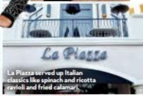
La Piazza served up Italian classics like spinach and ricotta ravioli and fried calamari.