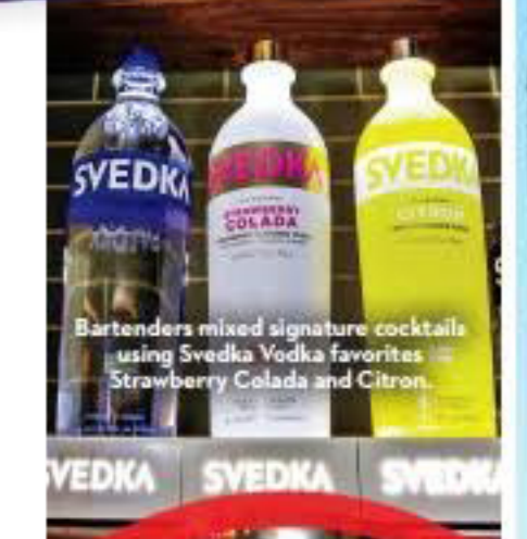
Bartenders mixed signature cocktails using Svedka Vodka favorites Strawberry Colada and Citron.