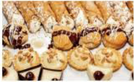
La Piazza Ristorante satisfied sweet teeth with assorted Italian desserts.