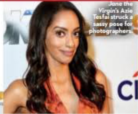
Jane the Virgin's Azie Tesfai struck a sassy pose for photographers.